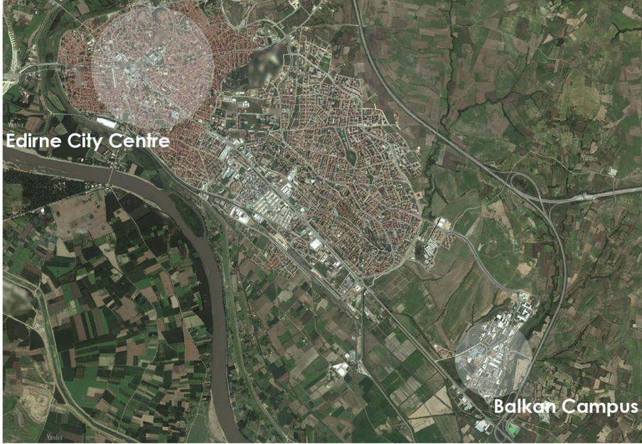
Edirne City Map

The conference will be take place in Balkan Congress Center which is located in Balkan Campus of Trakya University.